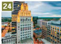
24 Reynolds Building Residences Developer: PMC Properties Units: 120 (for rent) Built: 2016 PMCPropertyGroup.com