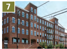
7 Tar Branch Towers Developer: Beau Dancy Units: 27 (for sale) Built: 2006 BDancyConstruction.com