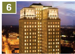
6 Nissen Building Developer: Historic Restoration, Inc. Units: 145 (for rent) Built: 2005 NissenApartments.com