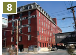
8 Piedmont Leaf Lofts Phase 2 Developer: Landmark Group Units: 33 (for sale) Built: 2006 LandmarkDevelopment.biz