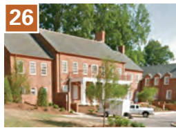
26 YWCA Developer: Benton Investments Units: 25 (for sale) Built: 2017