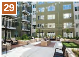
29 Grubb WFIQ Developer: Grubb Properties Units: 350 (for rent) Built: 2017 GrubbProperties.com