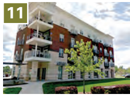
11 The Summit at Gateway Developer: D.L. Davis Co. Units: 26 (for sale) Built: 2009