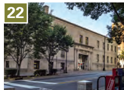
22 50 West Fourth Street Developer: Clachan Properties Units: 57 (for rent) Built: 2015 50westfourth.com