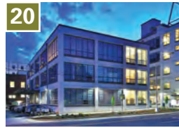
20 Plant 64 Developer: Chris Harrison Prop. Units: 243 (for rent) Built: 2014 Plant64.com