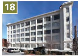
18 Winston Factory Lofts Phase 2 Developer: Clachan Properties Units: 86 (for rent) Built: 2014 WinstonFactoryLofts.com