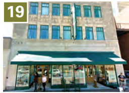
19 The Village Apartments Developer: Us Development Units: 45 (for rent) Built: 2014 TEJRentals.com