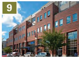
9 Trader's Row Developer: Chapman Co. Units: 16 (for sale) Built: 2007