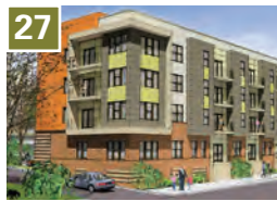
27 757 North Developer: Goler CDC Units: 105 (for rent) Built: 2017 GolerCDC.com