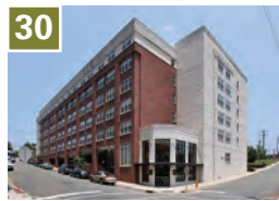
30 Goler Manor Developer: Goler CDC Units: 79 (for rent) Built: 2008