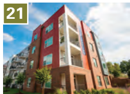
21 The Link Brookstown Developer: Samet Units: 200 (for rent) Built: 2014 LinkBrookstown.com