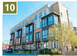
10 West End Village Developer: Fowler Investment Co. Units: 72 (for sale) Built: 2008