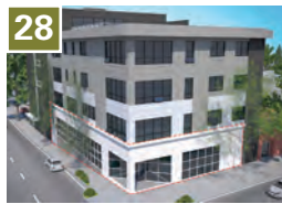
28 Twin City Condos Developer: GEMCAP Units: 21 (for sale) Built: 2017 TwinCity-Lofts.com