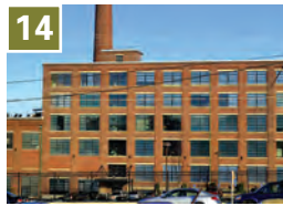
14 Winston Factory Lofts Developer: Clachan Prop. Units: 85 (for rent) Built: 2009 WinstonFactoryLofts.com