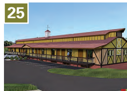
25 Livery Developer: Lisha Construction Units: 27 (for rent) Built: 2016 TheLiveryApts.com