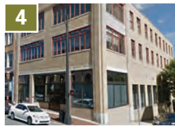
4 One West Fifth Street Developer: Chapman Co. Units: 30 (for sale) Built: 2003