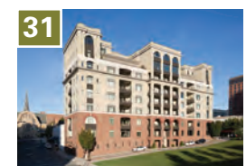
31 One Park Vista Developer: One Park Vista, LLC Units: 32 (for sale) Built: 2009