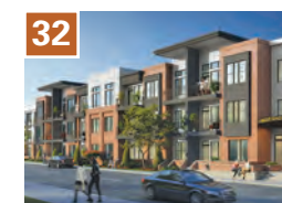
32 West End Station Developer: DPJ Residential Units: 229 (for rent) Under Construction dpjresidential.com