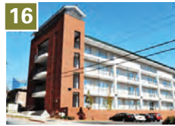
16 Hilltop House Phase 2 Developer: Bud Baker Units: 54 (for rent) Built: 2012 HilltopHouseDowntown.com