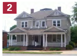
2 Holly Ave. Neighborhood Developer: Various Units: 200 Built: Various