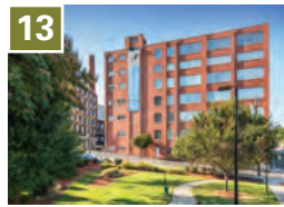
13 The Gallery Loft Apartments Developer: Landex Corp./ Goler CDC Units: 82 (for rent) Built: 2009 BellApartmentLiving.com