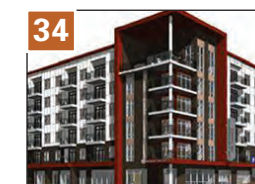
34 Grubb GMAC Developer: Grubb Properties Units: 225 (for rent) Under Construction GrubbProperties.com

Not all housing projects are depicted on this map. This map may contain errors. Contact Jason Thiel at jason@dwsp.org with any corrections.