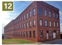
12 836 Oak Developer: Tobacco Sq. LLC Units: 30 (for rent) Built: 2009 836oak.com