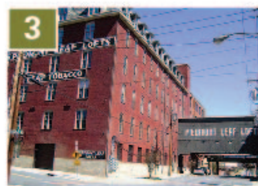
3 Piedmont Leaf Lofts Phase 1 Developer: Landmark Group Units: 14 (for sale) Built: 2001 LandmarkDevelopment.biz