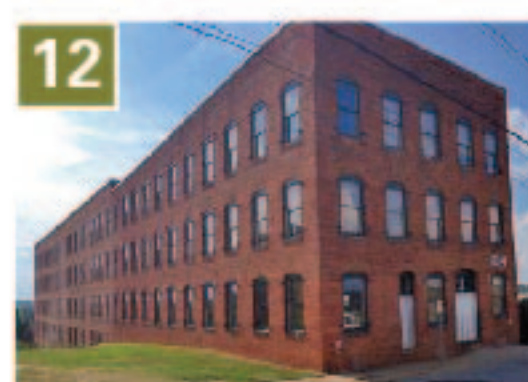
12 836 Oak Developer: Tobacco Sq. LLC Units: 30 Built: 2009 836oak.com