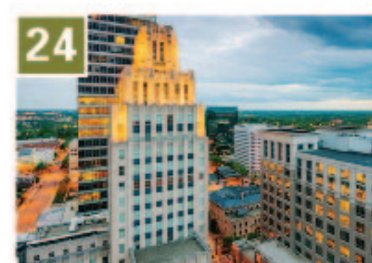
24 Reynolds Building Residences Developer: PMC Properties Units: 120 (for rent) Built: 2016 PMCPropertyGroup.com