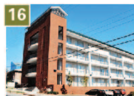
16 Hilltop House Phase 2 Developer: Bud Baker Units: 54 (for rent) Built: 2012 HilltopHouseDowntown.com