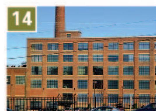
14 Winston Factory Lofts Developer: Clachan Prop. Units: 85 (for rent) Built: 2009 WinstonFactoryLofts.com