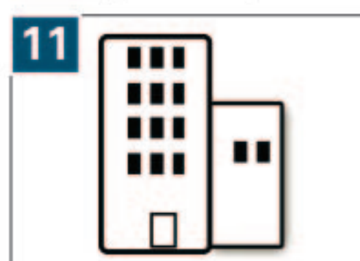
11 Mayfair Housing Developer: Mayfair Street Partners Units: 150 (for rent)