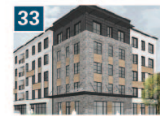
33 Metropolitan Village Developer: Liberty Atlantic Development Partners Units: 325 (for rent)