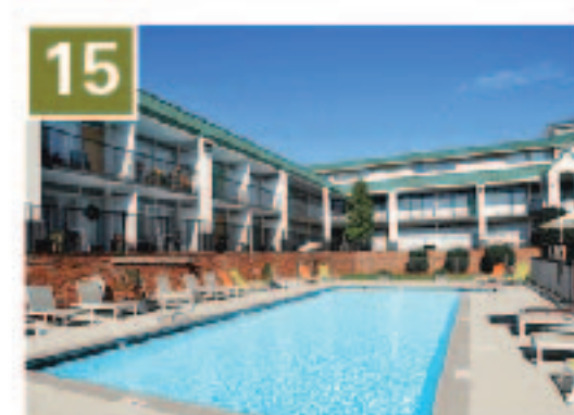
15 Hilltop House Phase 1 Developer: Bud Baker Units: 56 (for rent) Built: 2011 HilltopHouseDowntown.com