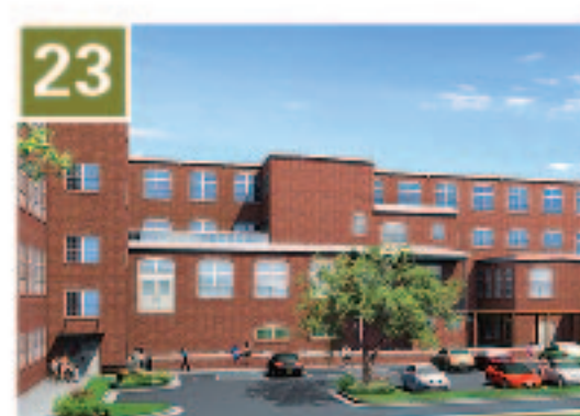
23 Mill 800 Developer: Ken Reiter Units: 170 (for rent) Built: 2016 mill800.com