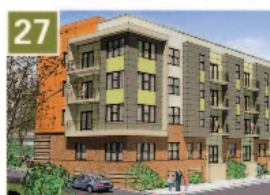
27 757 North Developer: Goler CDC Units: 105 (for rent) Built: 2017 GolerCDC.com