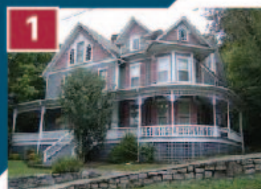
1 West End Neighborhood Developer: Various Units: 566 Built: Various HistoricWestEnd.org