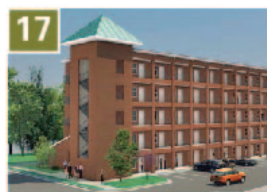
17 Hilltop House Phase 3 Developer: Bud Baker Units: 65 (for rent) Built: 2014 HilltopHouseDowntown.com