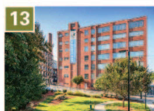
13 The Gallery Loft Apartments Developer: Landex Corp./Goler CDC Units: 82 (for rent) Built: 2009 BellApartmentLiving.com