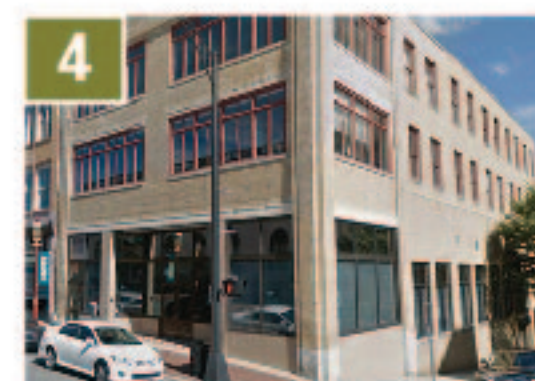
4 One West Fifth Street Developer: Chapman Co. Units: 13 (for sale) Built: 2003