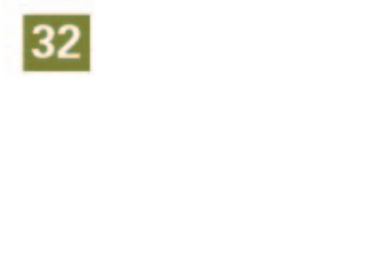
32 West End Station Developer: DPJ Residential Units: 229 (for rent) Built: 2020 dpjresidential.com