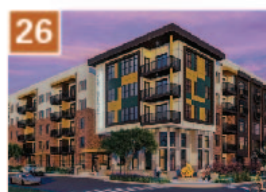
26 Artreaux Developer: DPJ Residential, LLC Units: 242 (for rent) Built: 2023 Under Construction