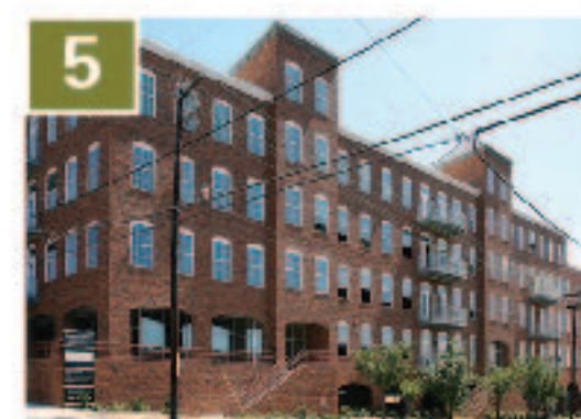
5 The Mill at Tar Branch Developer: Beau Dancy Units: 30 (for sale) Built: 2003 BDancyConstruction.com