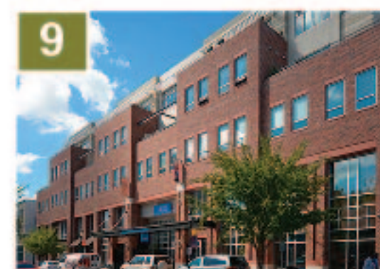
9 Trader's Row Developer: Chapman Co. Units: 16 (for sale) Built: 2007