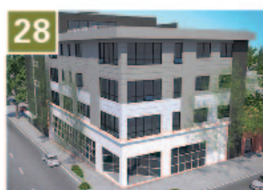
28 Twin City Condos Developer: GEMCAP Units: 21 (for sale) Built: 2017 TwinCity-Lofts.com