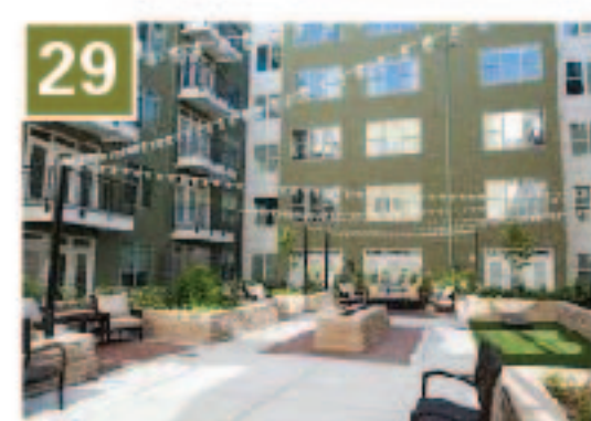
29 Link IQ Developer: Grubb Properties Units: 350 (for rent) Built: 2020 GrubbProperties.com