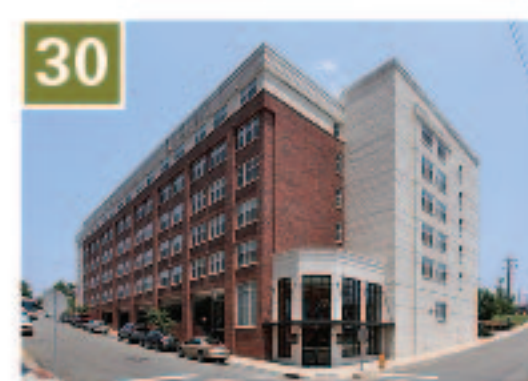
30 Goler Manor Developer: Goler CDC Units: 79 (for rent) Built: 2008