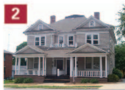
2 Holly Ave. Neighborhood Developer: Various Units: 200 Built: Various