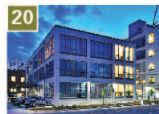
20 Plant 64 Developer: Chris Harrison Prop. Units: 243 (for rent) Built: 2014 Plant64.com