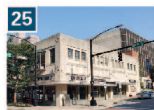
25 Chatham Building Apartments Developer: Predecessor to SCNC, LLC Units: 20 (for rent)