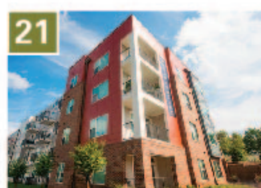
21 The Link Brookstown Developer: Samet Units: 200 (for rent) Built: 2014 LinkBrookstown.com