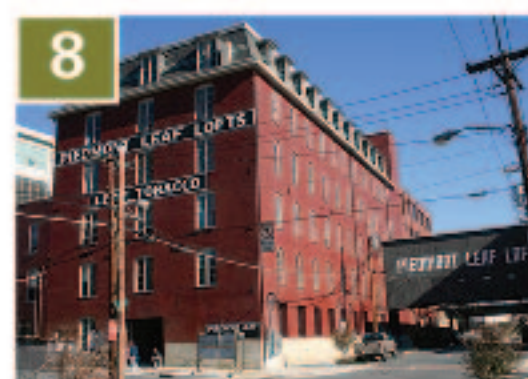
8 Piedmont Leaf Lofts Phase 2 Developer: Landmark Group Units: 33 (for sale) Built: 2006 LandmarkDevelopment.biz