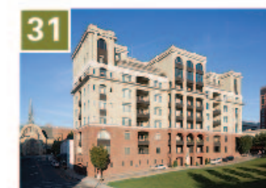
31 One Park Vista Developer: One Park Vista, LLC Units: 32 (for sale) Built: 2009