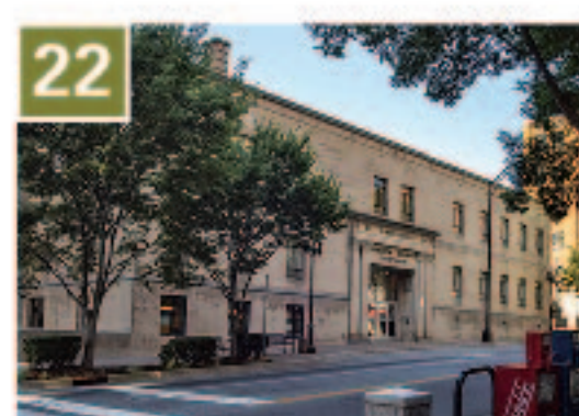
22 50 West Fourth Street Developer: Clachan Properties Units: 57 (for rent) Built: 2015 50westfourth.com