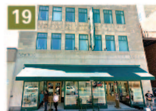
19 The Village Apartments Developer: Us Development Units: 45 (for rent) Built: 2014 TEJRentals.com