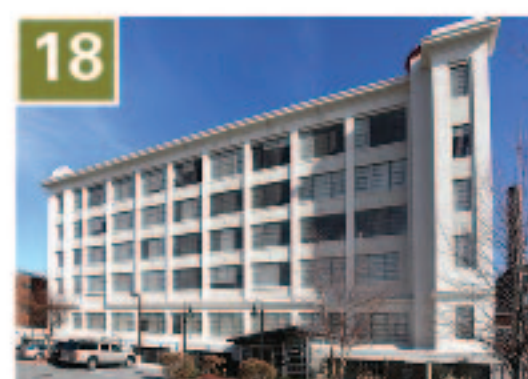
18 Winston Factory Lofts Phase 2 Developer: Clachan Properties Units: 86 (for rent) Built: 2014 WinstonFactoryLofts.com