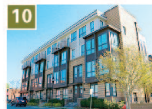
10 West End Village Developer: Fowler Investment Co. Units: 72 (for sale) Built: 2008