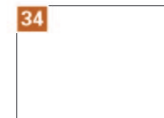
34 Link Fourth Street Developer: Grubb Properties Units: 225 (for rent) Under Construction GrubbProperties.com

Not all housing projects are depicted on this map. This map may contain errors. Contact Jason Thiel at jason@dwsp.org with any corrections.