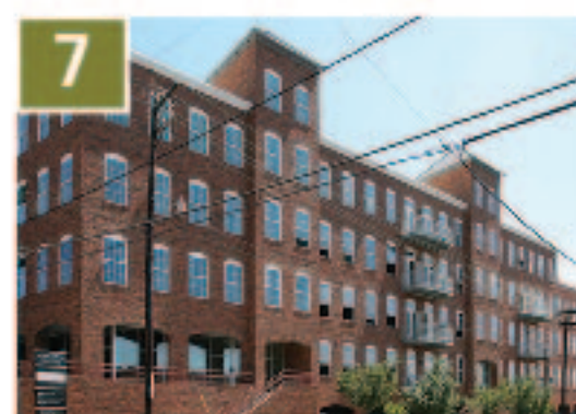
7 Tar Branch Towers Developer: Beau Dancy Units: 27 (for sale) Built: 2006 BDancyConstruction.com