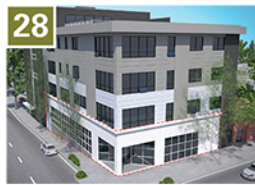
28 Twin City Condos Developer: GEMCAP Units: 21 (for sale) Built: 2017 TwinCity-Lofts.com