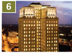
6 Nissen Building Developer: Historic Restoration, Inc. Units: 145 (for rent) Built: 2005 NissenApartments.com