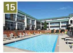
15 Hilltop House Phase 1 Developer: Bud Baker Units: 56 (for rent) Built: 2011 HilltopHouseDowntown.com