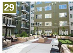
29 Link IQ Developer: Grubb Properties Units: 350 (for rent) Built: 2020 GrubbProperties.com