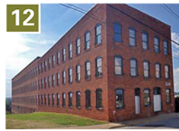
12 836 Oak Developer: Tobacco Sq. LLC Units: 30 Built: 2009 836oak.com