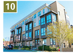
10 West End Village Developer: Fowler Investment Co. Units: 72 (for sale) Built: 2008