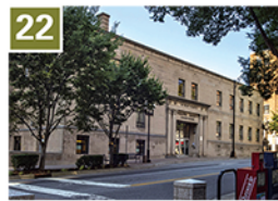
22 50 West Fourth Street Developer: Clachan Properties Units: 57 (for rent) Built: 2015 50westfourth.com