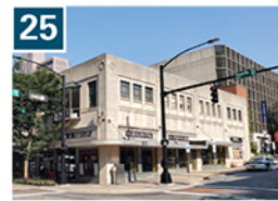
25 Chatham Building Apartments Developer: Predecessor to SCNC, LLC Units: 20 (for rent)