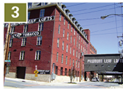
3 Piedmont Leaf Lofts Phase 1 Developer: Landmark Group Units: 14 (for sale) Built: 2001 LandmarkDevelopment.biz