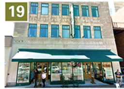
19 The Village Apartments Developer: Us Development Units: 45 (for rent) Built: 2014 TEJRentals.com