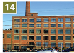
14 Winston Factory Lofts Developer: Clachan Prop. Units: 85 (for rent) Built: 2009 WinstonFactoryLofts.com