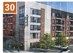
30 4th & Green Developer: CRA Development and Brown Investments Units: 106 (for rent)