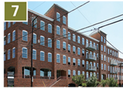
7 Tar Branch Towers Developer: Beau Dancy Units: 27 (for sale) Built: 2006 BDancyConstruction.com