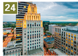
24 Reynolds Building Residences Developer: PMC Properties Units: 120 (for rent) Built: 2016 PMCPropertyGroup.com