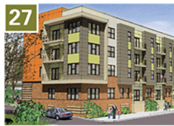
27 757 North Developer: Goler CDC Units: 105 (for rent) Built: 2017 GolerCDC.com