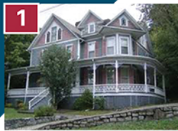
1 West End Neighborhood Developer: Various Units: 566 Built: Various HistoricWestEnd.org