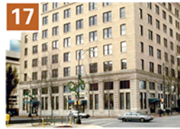
17 8 W. 3rd Street Developer: PMC Properties Units: 85 (for rent) Built: 2014 PmcPropertyGroup.com