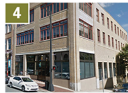
4 One West Fifth Street Developer: Chapman Co. Units: 13 (for sale) Built: 2003