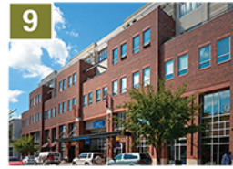
9 Trader's Row Developer: Chapman Co. Units: 16 (for sale) Built: 2007