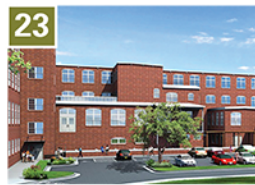
23 Mill 800 Developer: Ken Reiter Units: 170 (for rent) Built: 2016 mill800.com