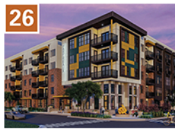
26 Artreaux Developer: DPJ Residential, LLC Units: 242 (for rent) Projected 2023 Under Construction