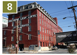
8 Piedmont Leaf Lofts Phase 2 Developer: Landmark Group Units: 33 (for sale) Built: 2006 LandmarkDevelopment.biz