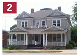
2 Holly Ave. Neighborhood Developer: Various Units: 200 Built: Various