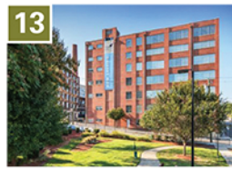
13 The Gallery Loft Apartments Developer: Landex Corp./ Goler CDC Units: 82 (for rent) Built: 2009 BellApartmentLiving.com