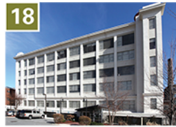
18 Winston Factory Lofts Phase 2 Developer: Clachan Properties Units: 86 (for rent) Built: 2014 WinstonFactoryLofts.com