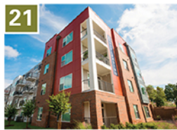
21 The Link Brookstown Developer: Samet Units: 200 (for rent) Built: 2014 LinkBrookstown.com