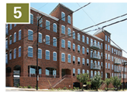
5 The Mill at Tar Branch Developer: Beau Dancy Units: 30 (for sale) Built: 2003 BDancyConstruction.com