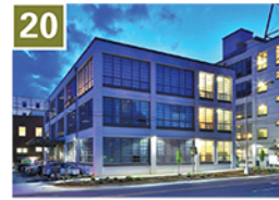
20 Plant 64 Developer: Chris Harrison Prop. Units: 243 (for rent) Built: 2014 Plant64.com