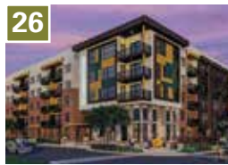
26 Artreaux Developer: DPJ Residential, LLC Units: 242 (for rent) Projected 2023 Under Construction