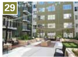
29 Link IQ Developer: Grubb Properties Units: 350 (for rent) Built: 2020 GrubbProperties.com