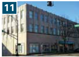
11 Loewy Building Developer: High Tide Capital Units: 50 (for rent)