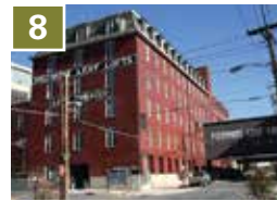
8 Piedmont Leaf Lofts Phase 2 Developer: Landmark Group Units: 33 (for sale) Built: 2006 LandmarkDevelopment.biz