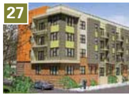
27 757 North Developer: Goler CDC Units: 105 (for rent) Built: 2017 GolerCDC.com