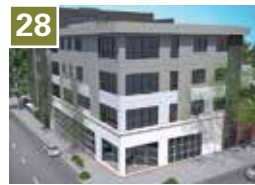
28 Twin City Condos Developer: GEMCAP Units: 21 (for sale) Built: 2017 TwinCity-Lofts.com