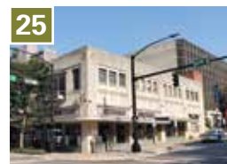
25 Chatham Building Apartments Developer: Predecessor to SCNC, LLC Units: 20 (for rent)