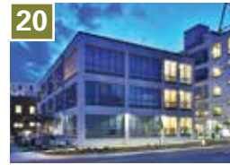
20 Plant 64 Developer: Chris Harrison Prop. Units: 243 (for rent) Built: 2014 Plant64.com