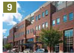
9 Trader's Row Developer: Chapman Co. Units: 16 (for sale) Built: 2007