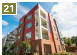
21 The Link Brookstown Developer: Samet Units: 200 (for rent) Built: 2014 LinkBrookstown.com