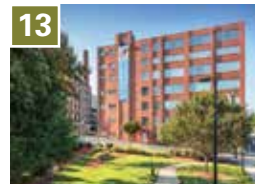
13 The Gallery Loft Apartments Developer: Landex Corp./ Goler CDC Units: 82 (for rent) Built: 2009 BellApartmentLiving.com