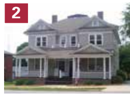
2 Holly Ave. Neighborhood Developer: Various Units: 200 Built: Various HistoricWestEnd.org