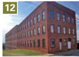
12 836 Oak Developer: Tobacco Sq. LLC Units: 30 Built: 2009 836oak.com