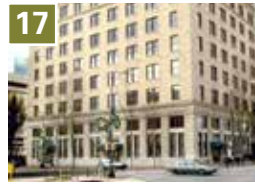
17 8 W. 3rd Street Developer: PMC Properties Units: 85 (for rent) Built: 2014 PmcPropertyGroup.com