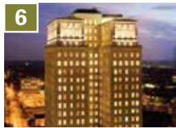
6 Nissen Building Developer: Historic Restoration, Inc. Units: 145 (for rent) Built: 2005 NissenApartments.com