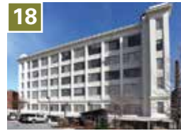
18 Winston Factory Lofts Phase 2 Developer: Clachan Properties Units: 86 (for rent) Built: 2014 WinstonFactoryLofts.com