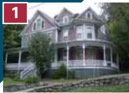
1 West End Neighborhood Developer: Various Units: 566 Built: Various HistoricWestEnd.org