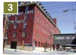
3 Piedmont Leaf Lofts Phase 1 Developer: Landmark Group Units: 14 (for sale) Built: 2001 LandmarkDevelopment.biz