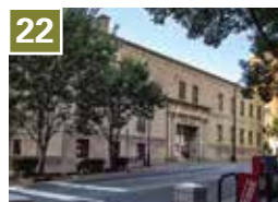
22 50 West Fourth Street Developer: Clachan Properties Units: 57 (for rent) Built: 2015 50westfourth.com