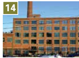
14 Winston Factory Lofts Developer: Clachan Prop. Units: 85 (for rent) Built: 2009 WinstonFactoryLofts.com