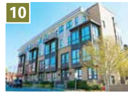
10 West End Village Developer: Fowler Investment Co. Units: 72 (for sale) Built: 2008