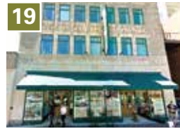
19 The Village Apartments Developer: Us Development Units: 45 (for rent) Built: 2014 TEJRentals.com