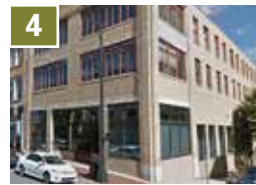
4 One West Fifth Street Developer: Chapman Co. Units: 13 (for sale) Built: 2003