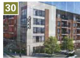
30 4th & Green Developer: CRA Development and Brown Investments Units: 106 (for rent)